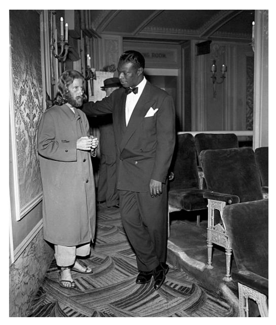
Plate 2. Eden Ahbez and Nat «King» Cole. We, The People the CBS Radio program, broadcast on television from CBS Television Studio 44, (the Maxine Elliott Theater) at 109 West 39th Street, New York, NY. Image dated June 1, 1948.

Below is a diagrammatic depiction of the concepts that hold together the argumentative system of the exhibition, the broader multimedia framework in the museum complex in Ascona today, that envelopes the 1978 exhibit (plate 3).