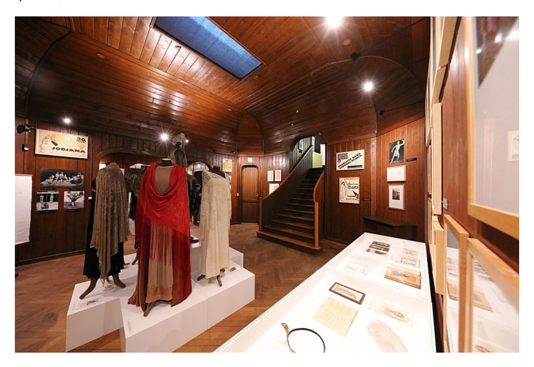
Plate 1. Interior of Casa Anatta, Ascona, Monte Verità exhibition in Ascona, Photo: bobo11, November 2017 Creative Commons Attribution-Share Alike 4.0 International license.

tal psychiatry – and, notably, to art that expresses the performative and liturgical element of Lebensreform (Yoka 2005). The Monte Verità exhibition was recently reinstalled exactly as it had been designed by Harald Szeemann as the centerpiece of an encyclopaedic permanent display on the Monte Verita (Lafranchi Cattaneo and Schwab 2013) (plate 1).